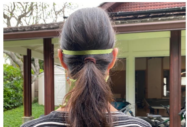
Behind the head strap ties in a bow below ponytail