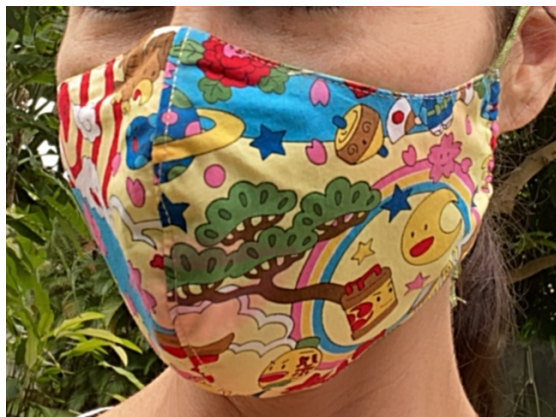
Finished Face Mask